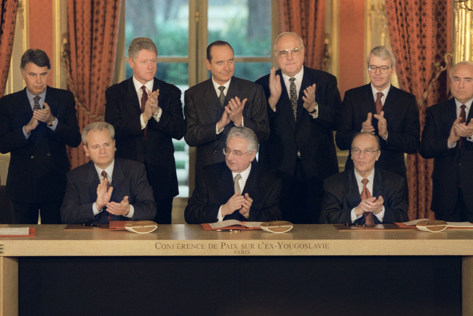
President of Serbia Slobodan Milosevic, President of Croatia Franjo Tudjman, and President of Bosnia and Herzegovina Alija Izetbegovic sign the Dayton Agreement in Paris on December 14, 1995.

domineering outside forces that shaped and organized their lives.