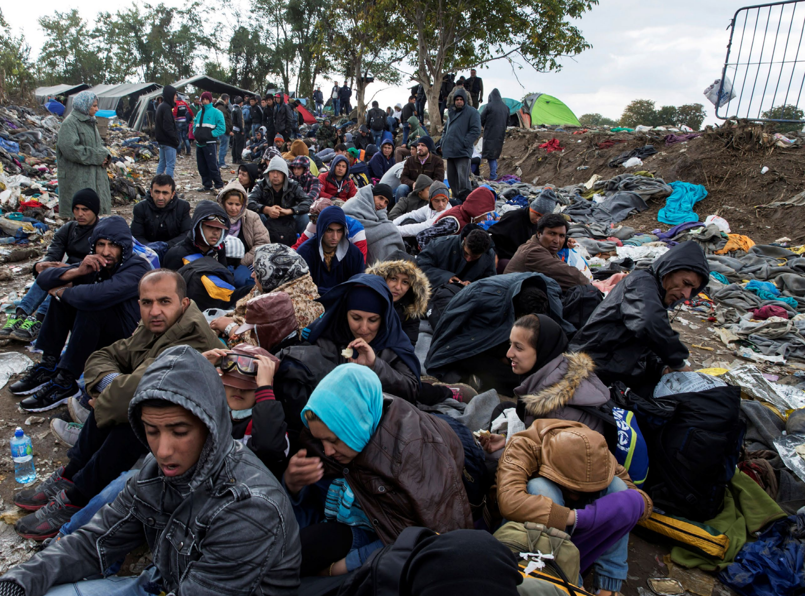
Migrants sit along a road as they wait to cross the border with Croatia near the village of Berkasovo, Serbia October 21, 2015.